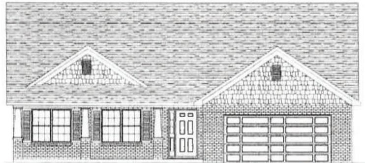
FRONT ELEVATION D