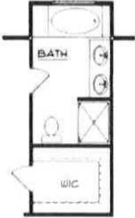
OPTIONAL MASTER BATH