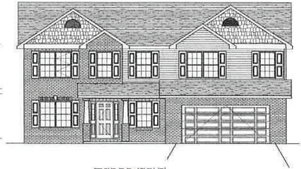
FRONT ELEVATION 'B' SCALE: 1/4" = 1'-0"